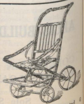
This Push Pram as illustrated 32/6