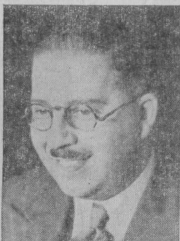
official United Party candidate

Make An "X" For a Genuine, Outstanding, Original and Devoted MAN