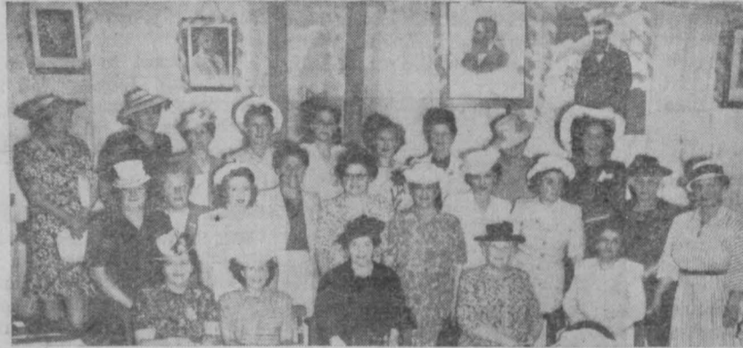
Committee members of the Port Elizabeth Women's Zionist League