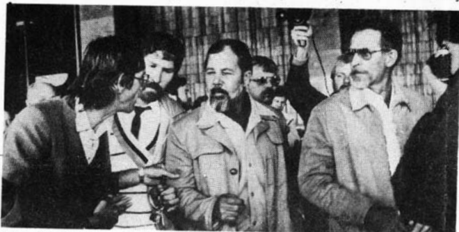
MR EUGENE TerreBlanche, leader of the AWB (centre) and two of his lieutenants surrounded by members of the media at Jan Smuts Airport yesterday. Mr TerreBlanche was protesting against the Dakar talks.