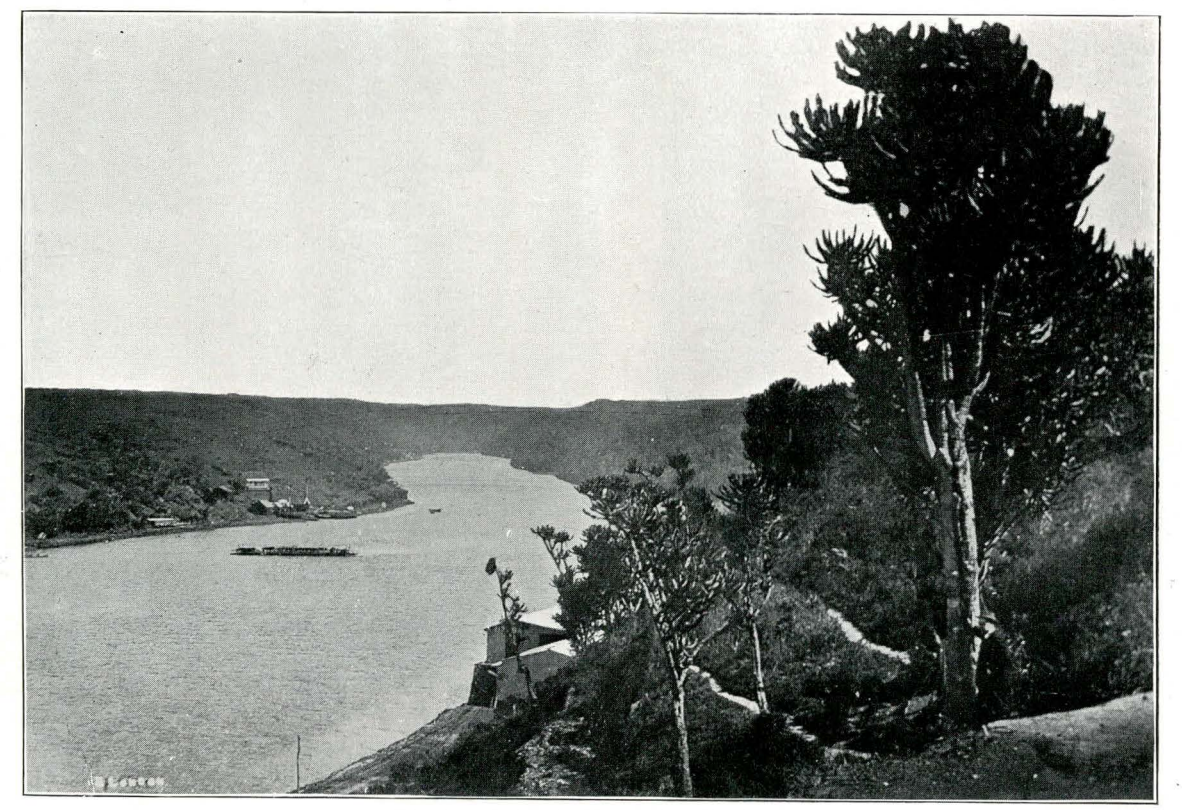
BUFFALO RIVER, EAST LONDON. [ 249 ]

[EDITOR'S NOTE.—It is to be regretted that, although the quality of the best barley grown in Cape Colony is equal to that of Californian, such a small quantity should be available at the Cape, as we were told that Ohlsson's Breweries are willing and anxious to give preference to barley of colonial growth, and would purchase it if possible up to their full malting capacity.]