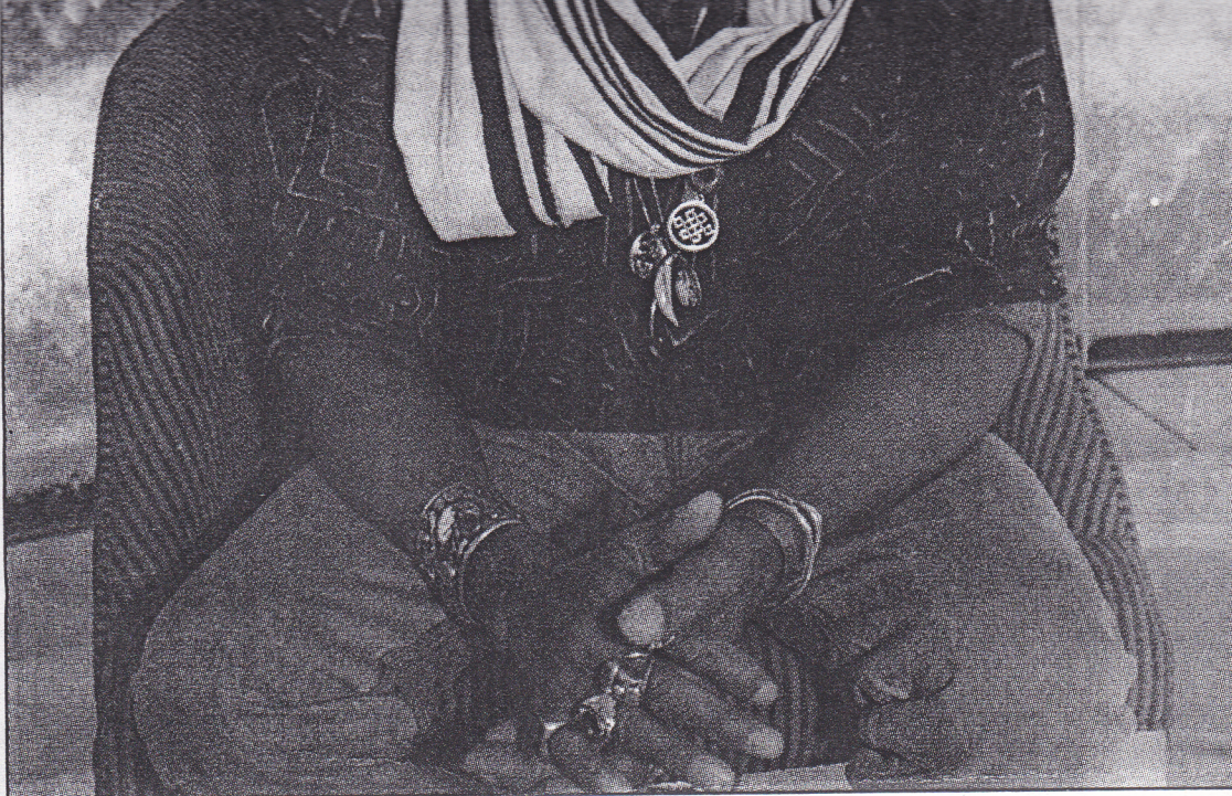
GUITAR MAN: Richie Havens will be in concert this Friday at the ICC.