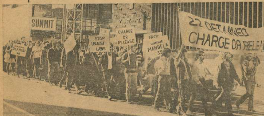
Wits University students march past the Braamfontein Post Office on their way to John Vorster Square to protest against the continued detention of Winnie Mandela, wife of Nelson Mandela, and 21 others under the Communism Act.