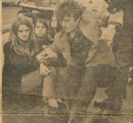
This is how the Witwatersrand students' protest march ended near John Vorster Square yesterday afternoon. The students were protesting over the detention of Winnie Mandela and 21 others under the Communism Act.