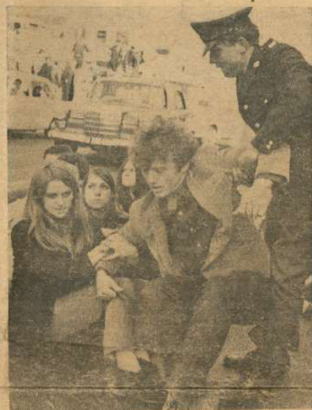
This is how the Witwatersrand students' protest march ended near John Vorster Square yesterday afternoon. The students were protesting over the detention of Winnie Mandela and 21 others under the Communism Act.