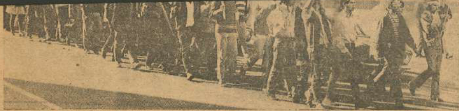
Wits University students march past the Braamfontein Post Office on their way to John Vorster Square to protest against the continued detention of Winnie Mandela, wife of Nelson Mandela, and 21 others under the Communism Act.