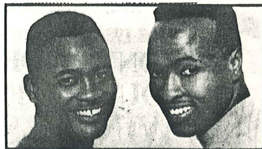
Marcalex . . . the brothers from Soweto, who gave us Quick, Quick and Heartbreakin' Love , will be topping the bill with Bright Blue at tomorrow's beachfront concert.