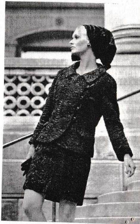
Illustrated SWAKARA BROADTAIL COSTUME

K. Borowski furs Inc. Lewis Furs (Pty.) Ltd.