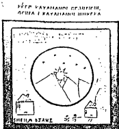
KAYAMANDI ENVIRONMENTAL COMMITTEE