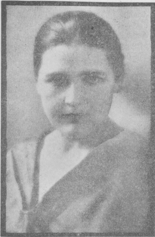
Miss Fanny Hurst.