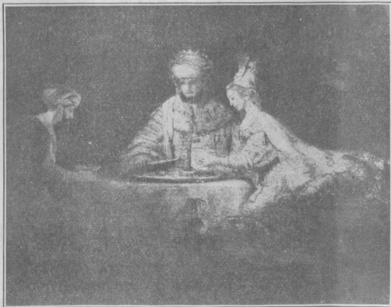
Ahasuerus at the Feast of Esther.— By Rembrandt.