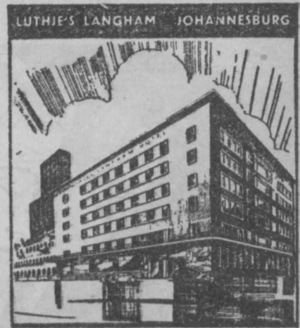
Kerk Street Telegrams: "Langham"

There will be two more opportunities of hearing Tauber — at the Plaza to-night, and at the Colosseum on Sunday night, and there is no doubt that he will draw capacity houses on both occasions.