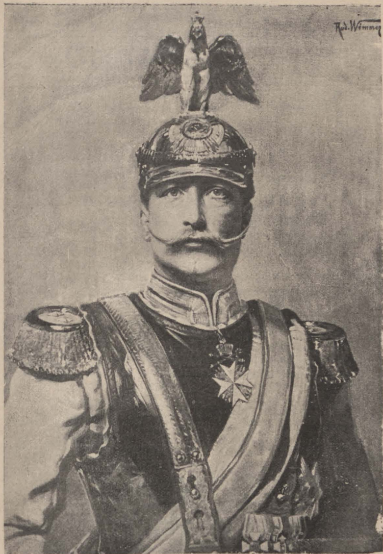
Portrait de Guillaume II, offert en 1892 au corps des volontaires de Westminster et retourné contre le mur en 1895, par les officiers de ce corps, après la lecture de la dépêche de l'empereur au président Kruger.