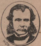
HON J.H. POPE.