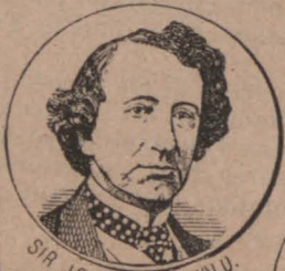
SIR JOHN A. McDONALD.