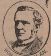
HON A.W. McLELAN.