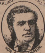
HON J.D.S. THOMPSON.