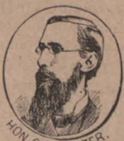
HON G.E. FOSTER.