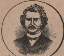
LOUIS DAVID RIEL.