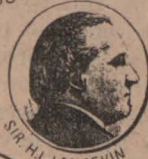
SIR H.L. LANGEVIN