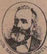
HON MACKENZIE BOWELL