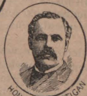
HON JOHN COSTIGAN