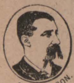
SIR A.P. CARON.