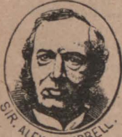
SIR ALEX. CAMPBELL.